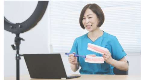
Oral Care Seminars

These educational seminars are presented by dental hygienists and other professionals. We offer hands-on, easy-to-understand seminars both online and in person. Each seminar is unique and can be designed to meet the specific challenges of a given corporation. Recommended for corporations that wish to educate their employees in an interactive manner.