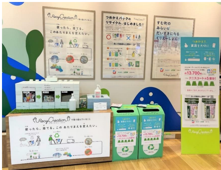
Collection boxes and displays at the entrance of the store