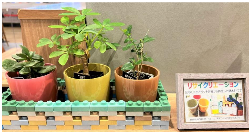
Mini foliage plants in plastic pots made from recycled plastic packaging in the food court inside the store.