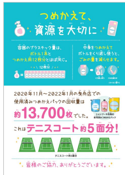
Poster about collection progress